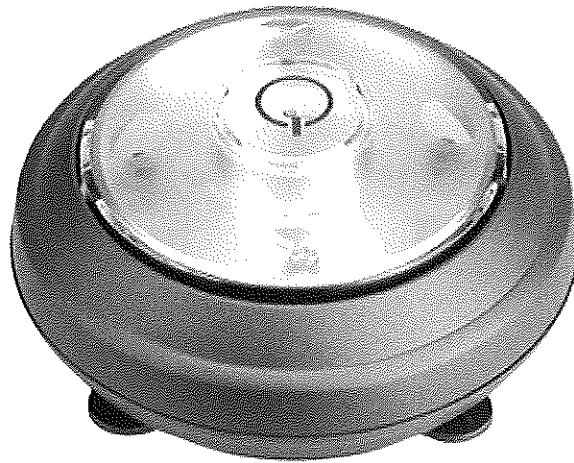
“Wireless Led Task Light” with model no. H-620