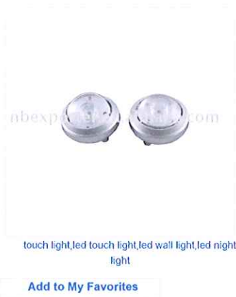
touch light,led touch light,led wall light,led night light