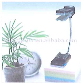
BT-1325 Promotion led book light