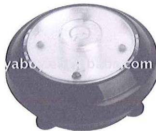
5LED Touch Lamp