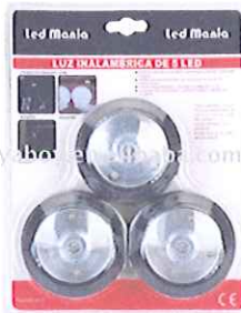
5 LED touch light