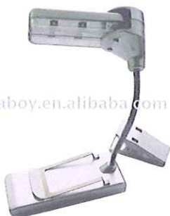
Book Light With Clip