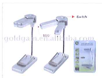
LED BOOK LIGHT