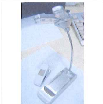
See larger image: 4 led book light