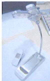
4 led book light