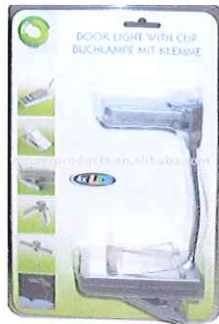
LED Book Light