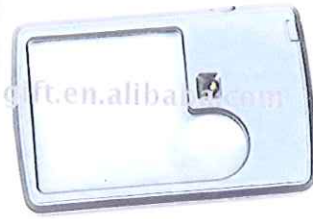
Plastic LED Magnifier