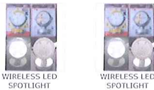
WIRELESS LED SPOTLIGHT