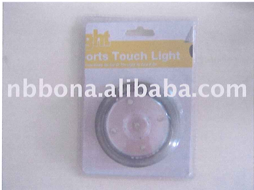
LED Touch Light