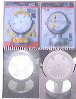
WIRELESS LED SPOTLIGHT