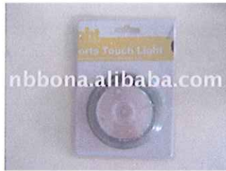
LED Touch Light