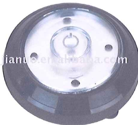
LED touch light