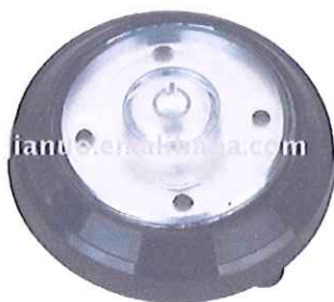
LED touch light