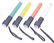
5 LED touch light