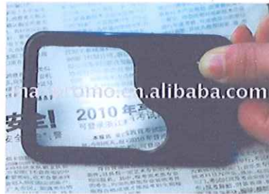
M-C013 LED magnifier