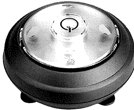
“Wireless Led Task Light” with model no. H-620