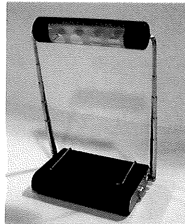
“Wireless LED Task Light” with model no. H-904