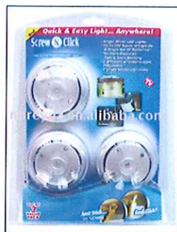
Press N Click Light