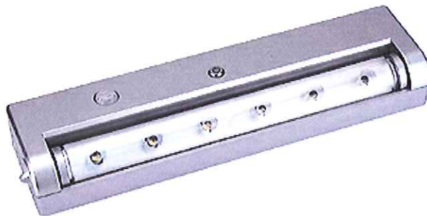
Name: "Wireless LED under Cabinet Light with Motion" Model no.: "H-640M"