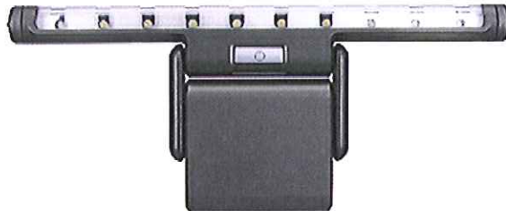
Name: "Wireless LED Wall Light" Model no.: "H-696"