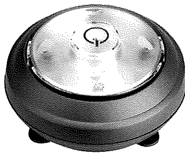
Name: Wireless LED Task Light Model no.: H-620