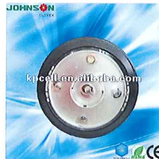
5 LED touch light hand touch light