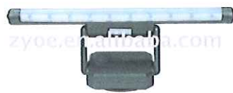
LED light (ZY-208854)