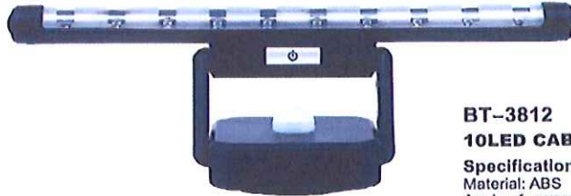
BT-3812 10LED CABINET SENSOR LIGHT

Specifications & Functions: Material: ABS Angle of coverage: 90-110° Sensor distance: 2-3m Sensor time: 20-25s Operated by 3*AA batteries (excluded)