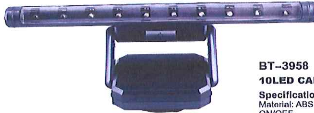
BT-3958 10LED CABINET LIGHT

Specifications & Functions: Material: ABS Angle of coverage: 90-110° Sensor distance: 2-3m Sensor time: 20-25s Operated by 3*AA batteries (excluded)