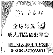
成人用品创业平台 全球领先 成人用品创业平台 全球领先 成人用品创业平台 全球领先