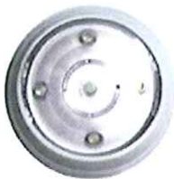
5 LED Puck Light