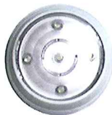
5 LED Puck Light

5LED puck light,use 3AAA batteries not included,size: 90X90X45mm