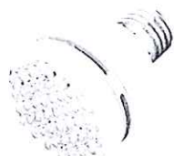
3W E27 110-260V White Light Bulb US $4.00 / piece 60% OFF