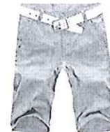
Men's Summer Leisure Trousers US $11.36 / piece 60% OFF