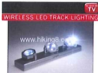
LED Track Lighting

Model No: 62029B Place of Origin: Zhejiang, China (Mainland) Light Source: LED Style: Others Material: Plastic Color: White Brand Name: hiking fuction: lighten