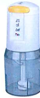
Electric Food processor