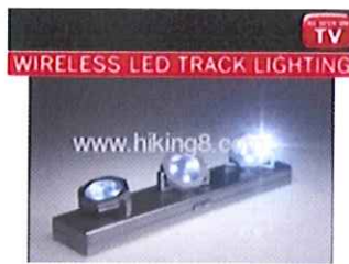
LED Track Lighting

Model No: 62029B Place of Origin: Zhejiang, China (Mainland) Light Source: LED Style: Others Material: Plastic Color: White Brand Name: hiking function: lighten